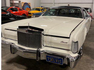
Elvis' Lincoln Continental