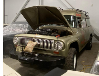
John Wayne's 1966 Travelall